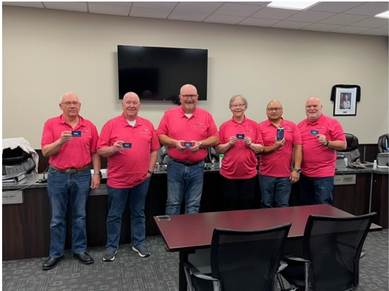
Gibbons Council rocking pink shirt day and sporting their Library cards. Look close we even have a digital library card in there. You can use your phone as your card with the TRACpac app.