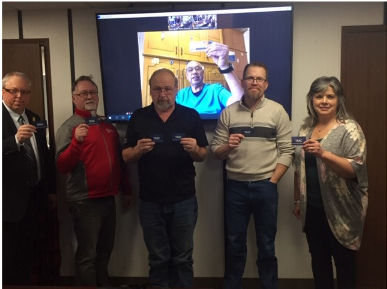
This is Elk Point’s council and admin with their library cards. They rock – be like this council, good looking and well read.