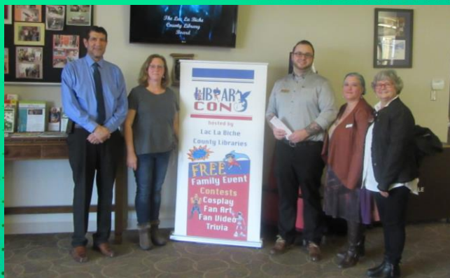
Receiving donation from Boston Pizza